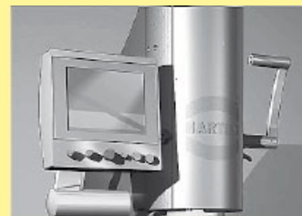
Visual guiding system via touch monitor

The machine employs the automatic switch-off system "autosense", known worldwide for its reliability. The different connector types and the tolerances of the pcb are automatically recognised and taken into consideration at the press-in operation, thus maximising the process security.